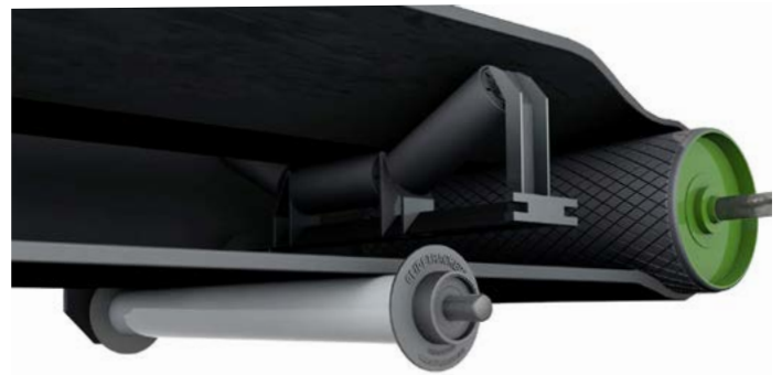
Glidetracker™ fitted at tail section to improve feed point

Easy to install and low maintenance, Glide Tracker™ Roller keeps your belt tracked, preventing damage and minimising material spillage and associated clean-up costs.