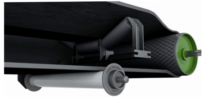
Glidetracker™ fitted at tail section to improve feed point tracking

Easy to install and low maintenance, Glide Tracker™ Roller keeps your belt tracked, preventing damage and minimising material spillage and associated clean-up costs.