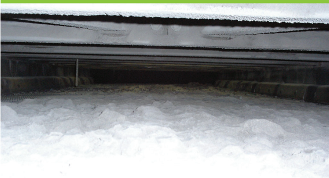
Pegging and blinding on wire screens