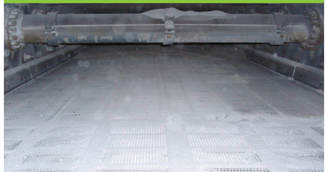
The difference is clear with self-cleaning Supoflex